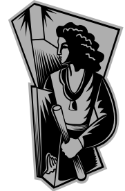
The Old Becomes the New!

LSA Website: http://home.earthlink.net/~lsamichigan