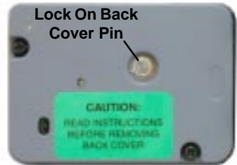
Figure 1 - Lock On Back Cover