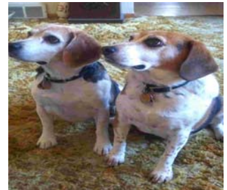
Caesar (♂ Marcus) LSA Mascots